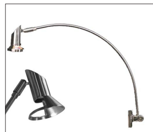
50W Halogen Bannerstand Spot Light