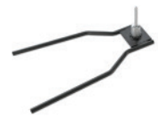
Car Tire Base