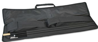
Includes Nylon Carry Bag and Ground Spike