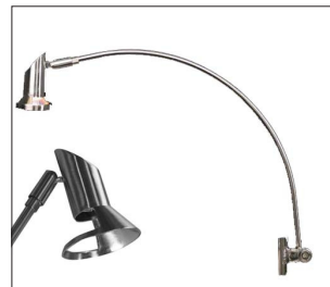
50W Halogen Bannerstand Spot Light